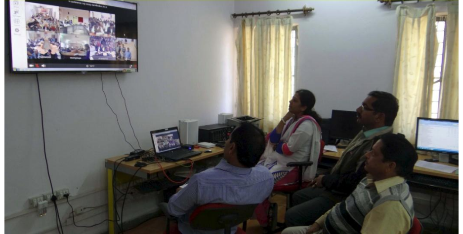
Video conferencing of Collector with Block level officers and KVK staff