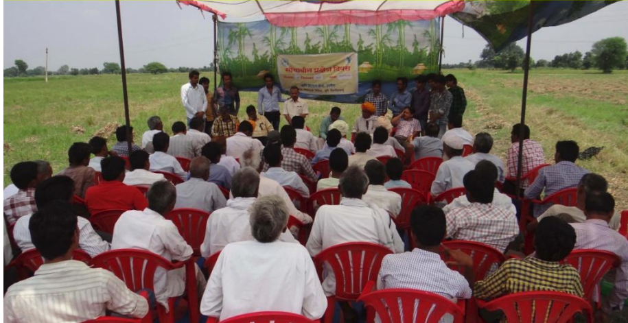
Field Day on Soybean at Village Kankariya Chand