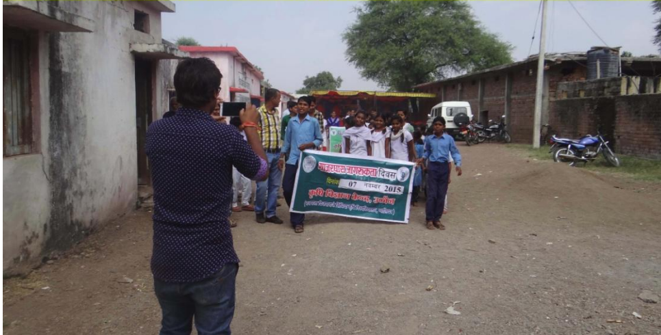
Awareness Rally of School Students on Parthenium organized at village level