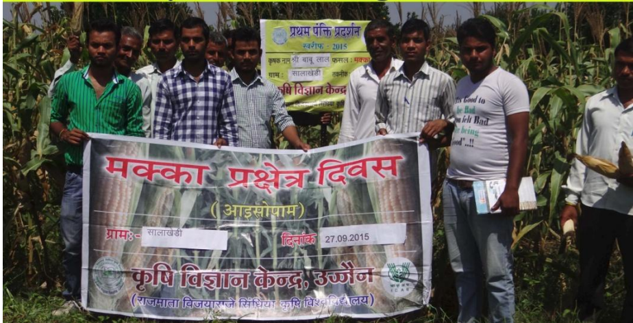
Field Day on Maize at Village Salakhedi