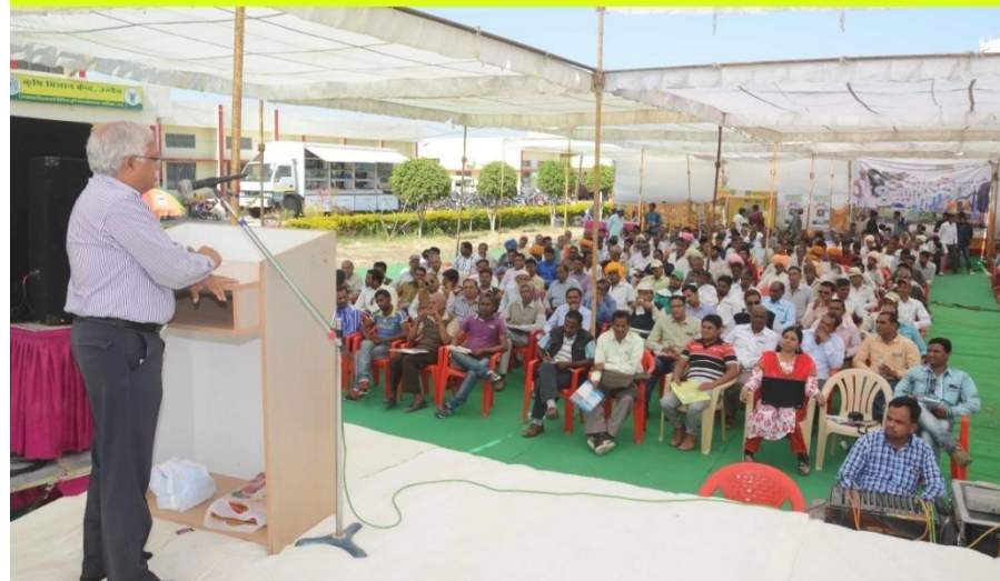
Farmers gathering during Pre-Rabi Kisan Sammellan 5-2-2016