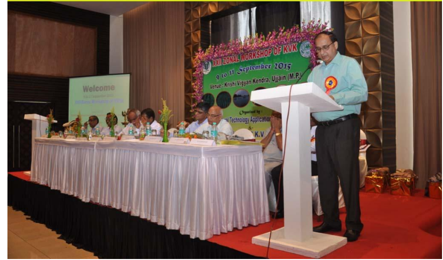
Hon'ble DDG(Agril.Extn), ICAR addressing during XXII Zonal KVK Workshop at Ujjain