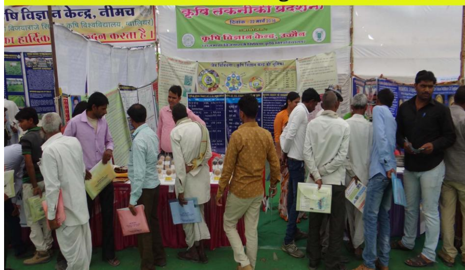
View of KVK exhibition during Kisan Sammellan