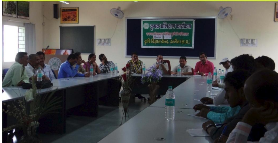
A View of On-campus training programme