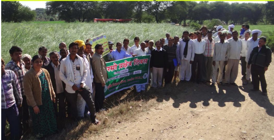
A View of Field Day on Mustard