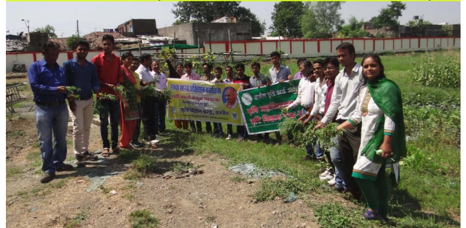
Parthenium eradicated by RAWE and KVK staff under “Swachh Bharat Abhiyan”