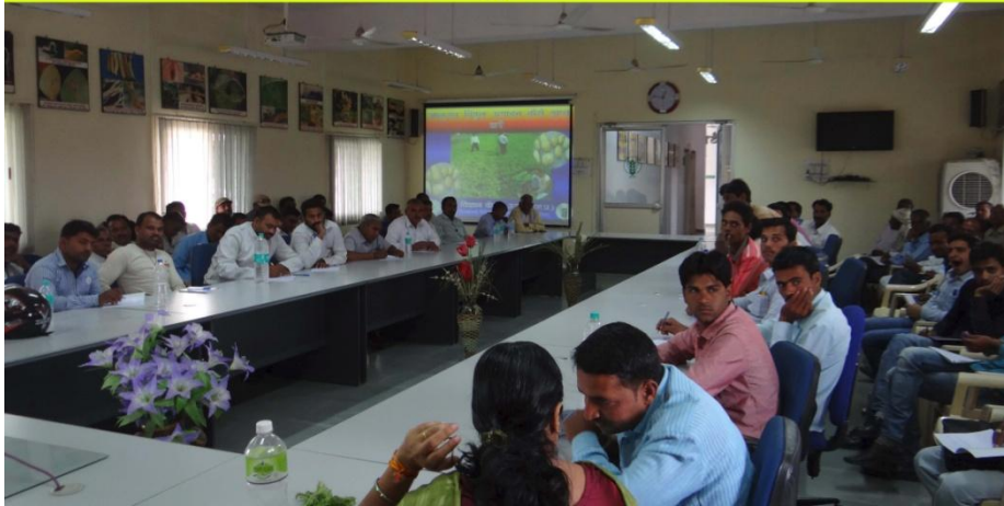
View of Technology Week Celebration