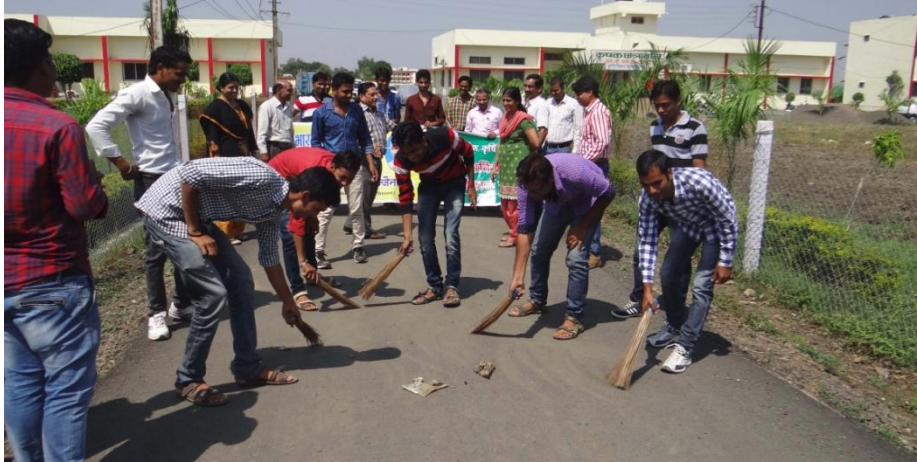
Activities of Cleanliness under “Swachh Bharat Abhiyan”