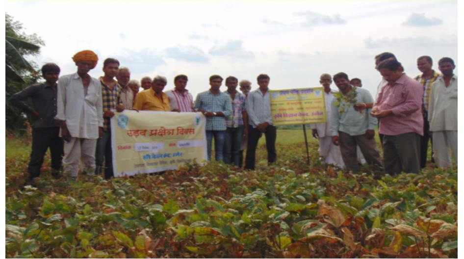
Field Day on Blackgram at Dhablagauri