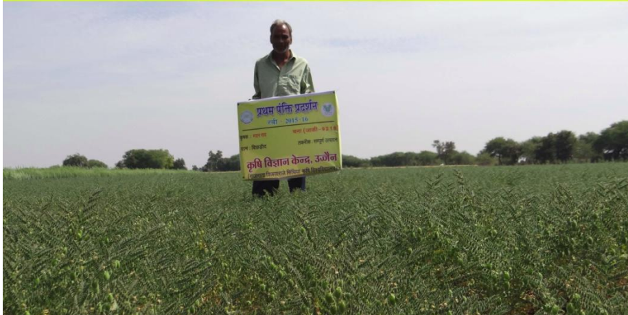
FLD on Chickpea JAKI-9218(Full Package)