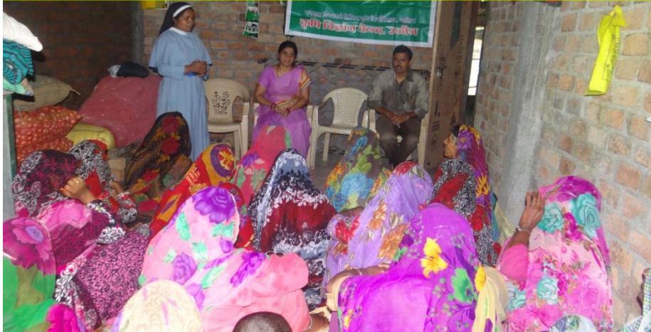
A View of Off-campus training programme