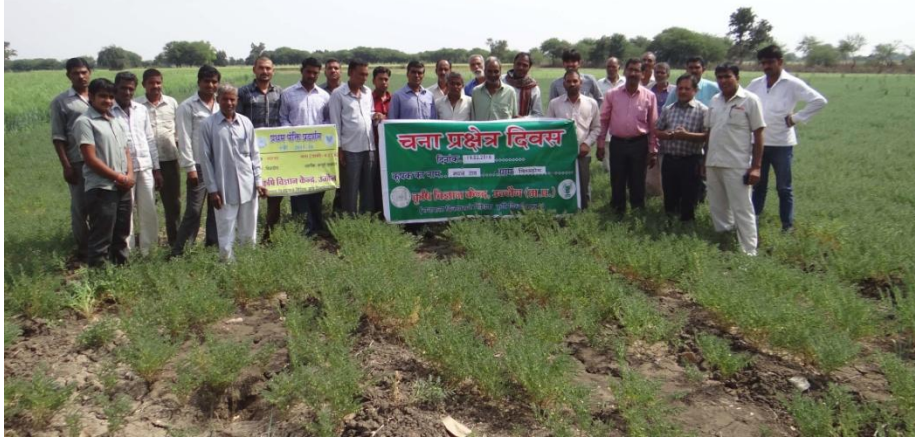
Field Day on Chickpea at Village Bichhrod