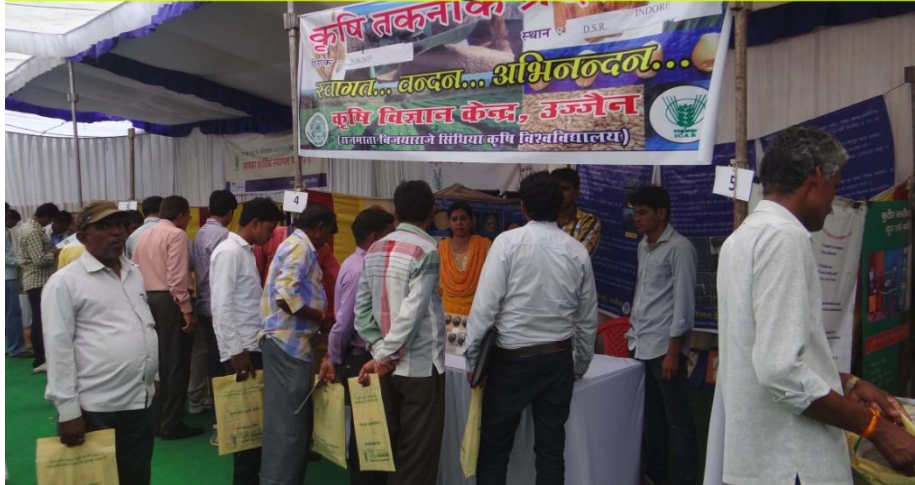
Farmers interaction during exhibition at DSR, Indore