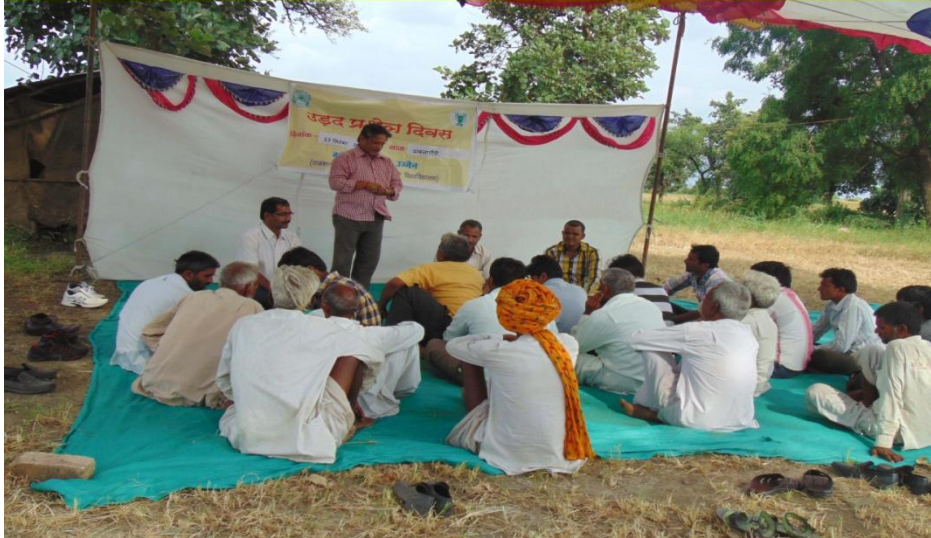
A view of Field Day on Blackgram