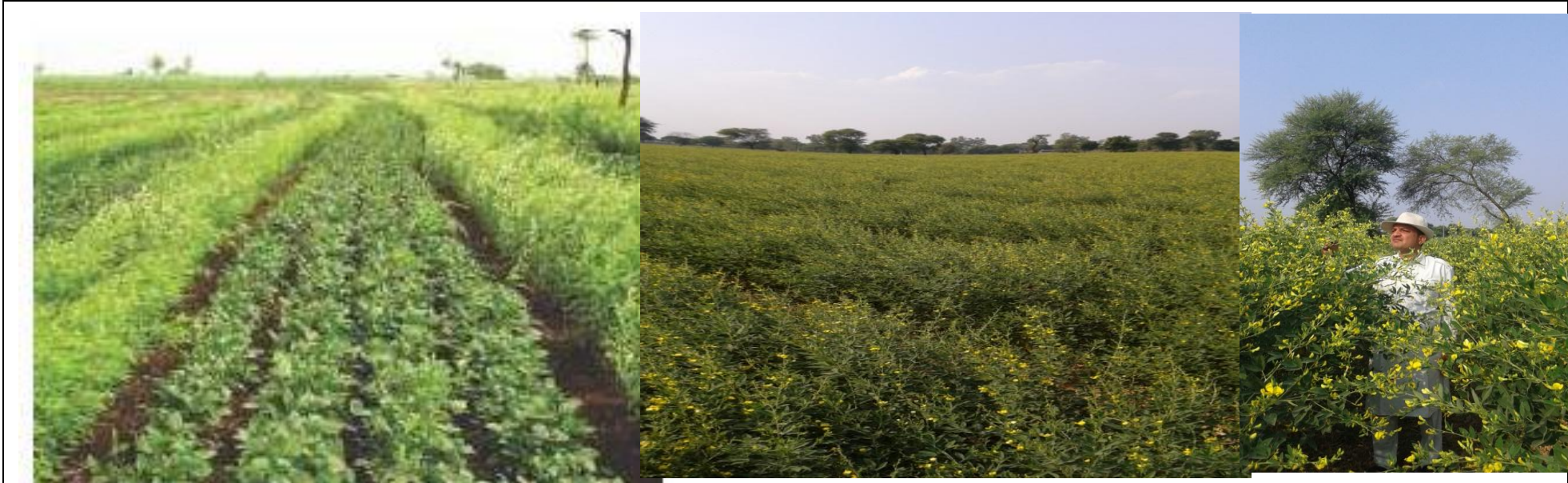
Intercropping between Soybean and Pigeonpea(4:2)