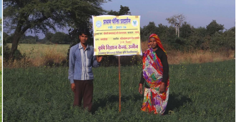
FLD on Chickpea(Seed treatment with Molybdenum 1gm/Kg of seed)