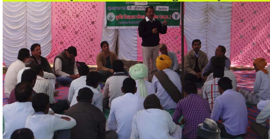
Field Day on Mustard at Village Bihariya