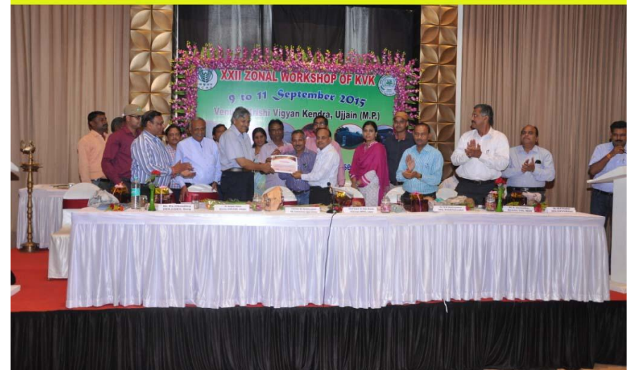
KVK Ujjain team receiving certificate during XXII Zonal KVK Workshop at Ujjain